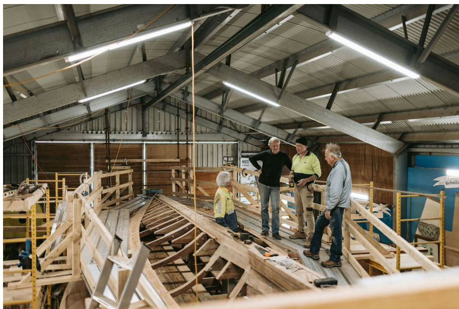
Reconstruction of the boat "Independence" built in 1803 at American River.

Surrounded by bushland and boasting spectacular coastal views stretching to mainland Australia, American River is an aquatic playground where days are best spent feasting on seafood, swimming, boating, fishing and wildlife watching. Devour oysters, marron, abalone and King George whiting on the shores of American River at The Oyster Farm Shop . With everything prepared fresh on site, walk across the road to the jetty, dangle your legs over the edge and tuck into oysters farmed 200 meters away. Once you've had your fill, head to the sandy shores of Island Beach to soak up the sun or explore the protected wetlands of Pelican Lagoon. At the end of the day, kick back at your very own luxury Oceanview Eco Villa nestled atop Nepean Bay.