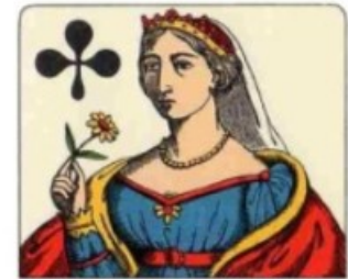
ACBL Bright Leaf Unit 191

Attendance at the Bright Leaf Summer Sectional was 21 % lower than in 2017. More than half the attendees (53%) this year were non-unit members. To understand better how the unit can provide opportunities for our members to play and enjoy bridge, we will be sending out a short questionnaire to elucidate the decisions that influenced your attendance – or not – at our tournaments. Please take a few minutes to complete the survey.