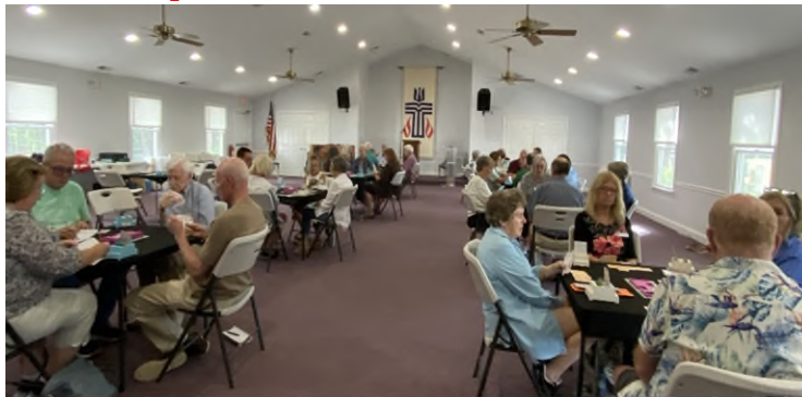
NLM Sectional Players