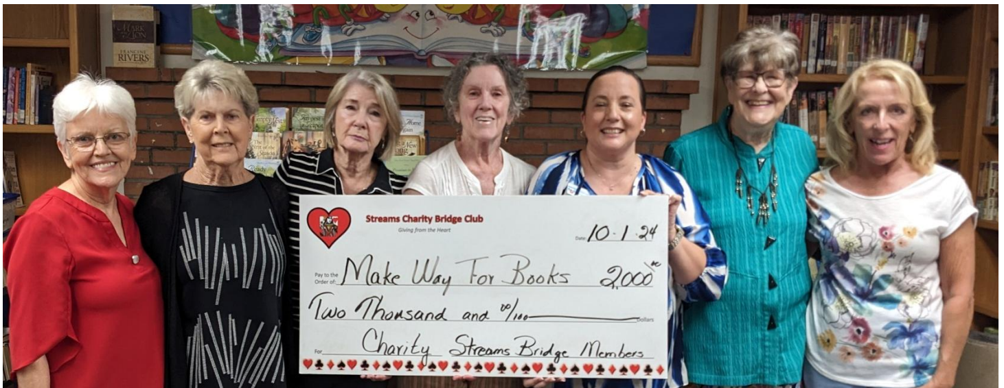
Our October charity was Make Way for Books With members who have worked to teach people to read.