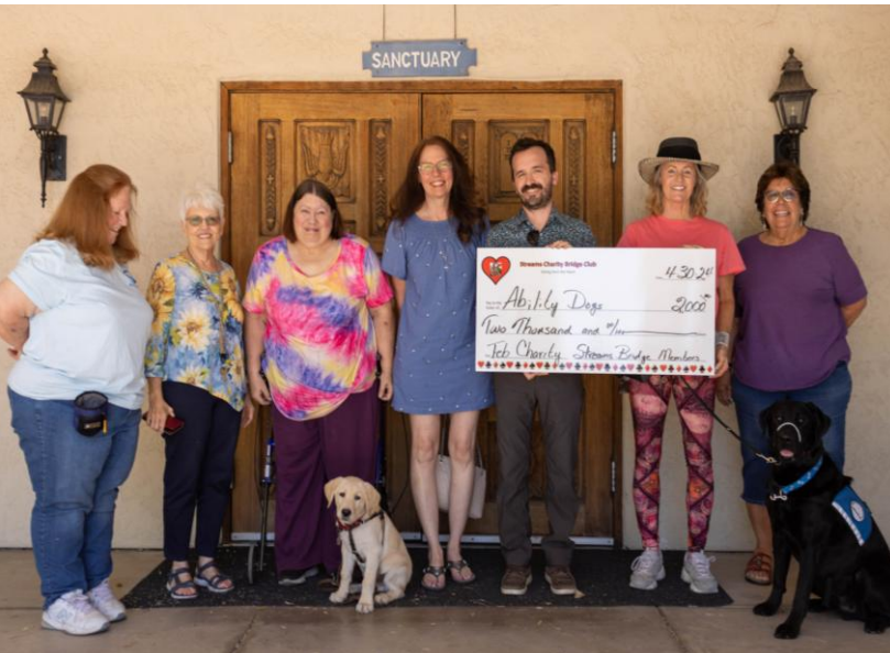
Our February Charity was Ability Dogs