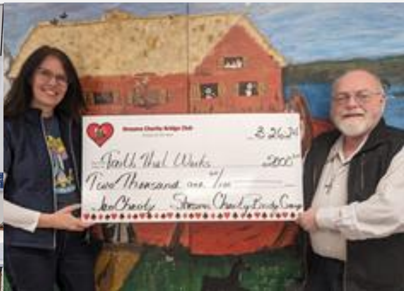
January Charity – Faith that Works