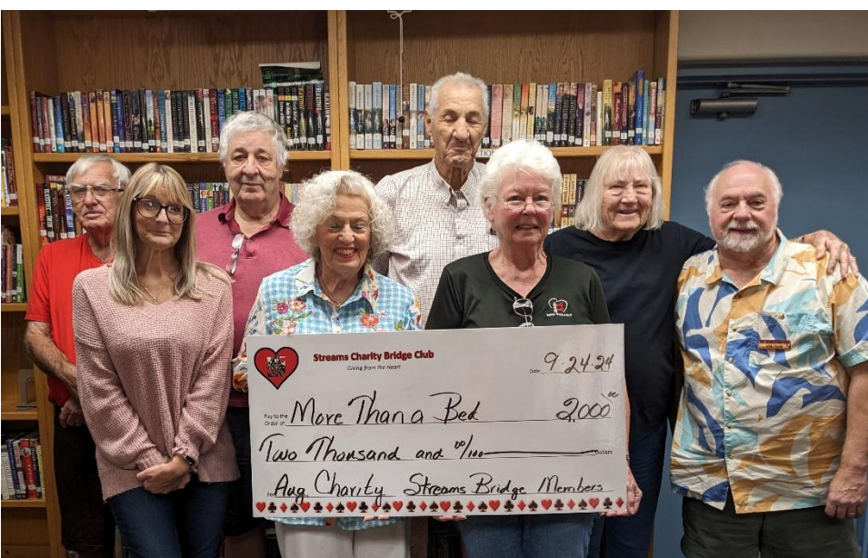
Our August Charity was More than a Bed with our members who cared for Foster Children