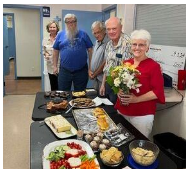
Hurd brought a cake and members brought lots of goodies to celebrate our members amazing accomplishments in the Regional.