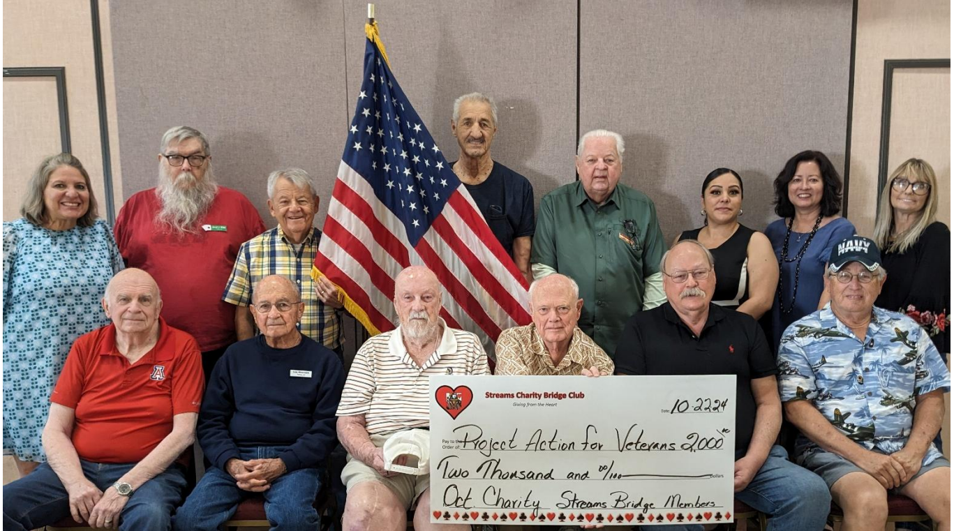
Our September Charity was Project Action for Veterans With our members who are Veterans