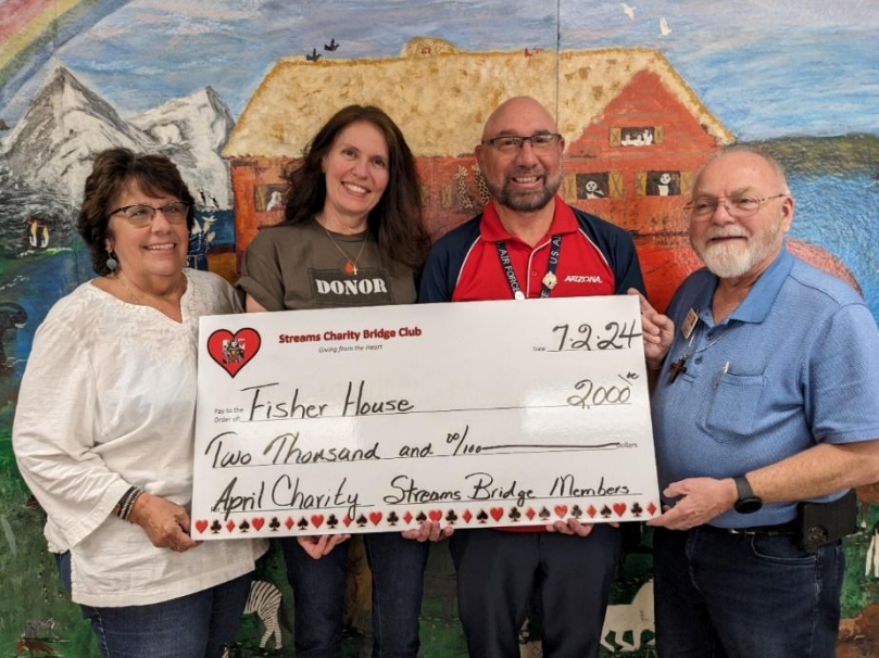
Our April Charity was Fisher House