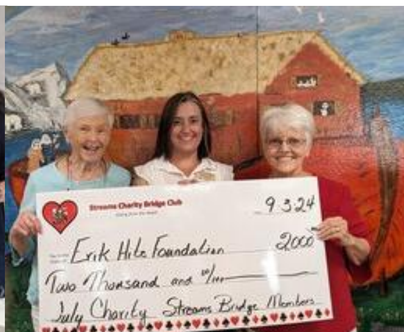
Our July Charity was Erik Hite Foundation