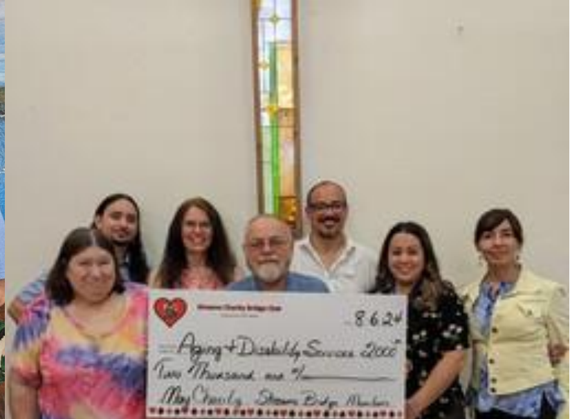
Our May Charity was Aging & Disability Services