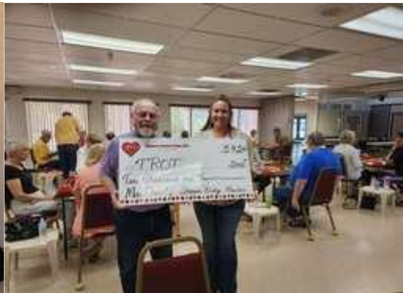
Our March Charity was TROT