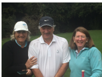
Pearson who was taking the photo