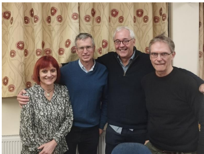
Players in capitals are EWBA members.

The Claret Jug is normally associated with the Open Championship at Golf, the oldest of the majors, but it is also awarded for the best performance in the EWBA over the year.