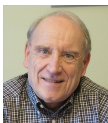
Glenn Torrie Education Chair