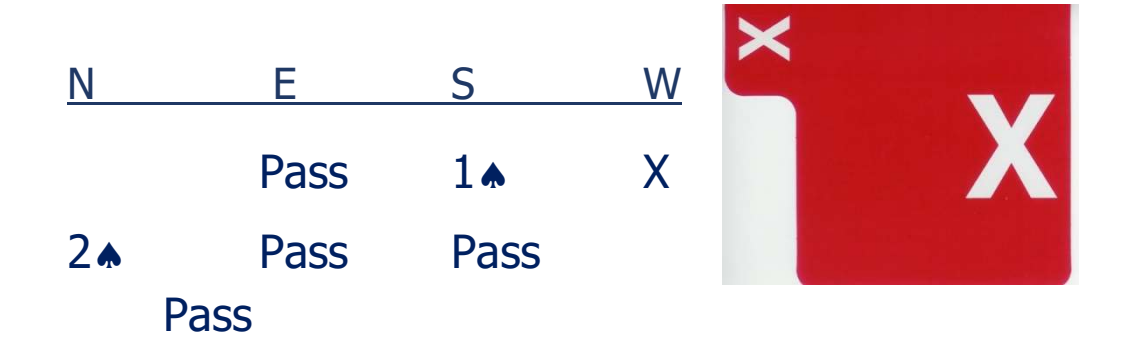
The 2 \( \infty \) contract is not doubled and scores normally.

If any player bids, the double is left on the table, but it's effect is cancelled.