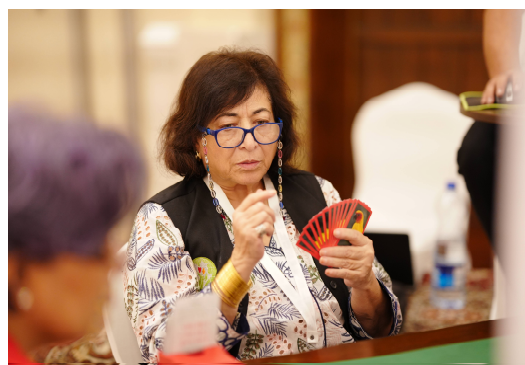
YES .... Counting is Important

The only defence to break the squeeze is to play the DJ when HA is won.