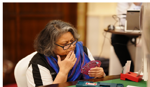
Has all the trumps been taken out or not?