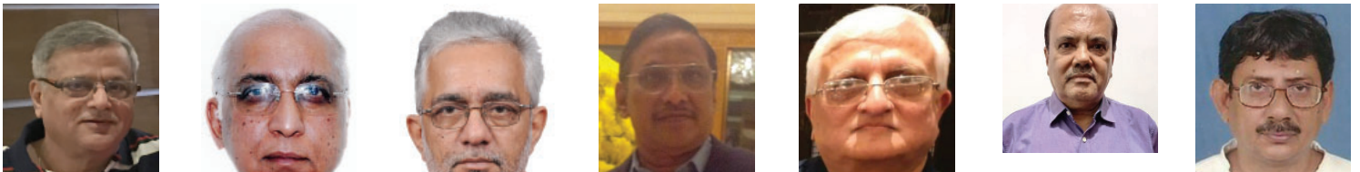
The India Senior Team representing BFAME at the World Championships. From left to right: [REDACTED], [REDACTED], [REDACTED], [REDACTED], [REDACTED], [REDACTED], [REDACTED]