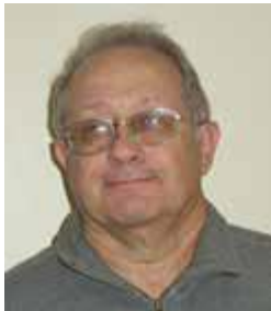
Pomona – Covina