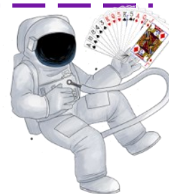
HUNTSVILLE BRIDGE ASSOCIATION