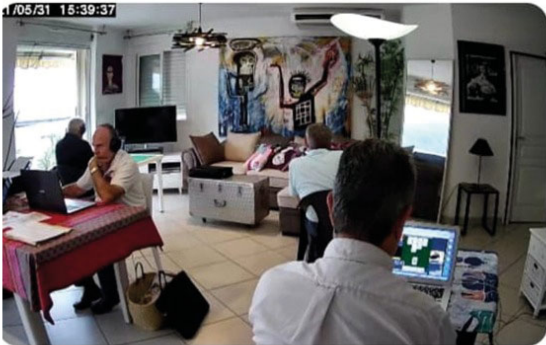
One of the many cameras at the remote sites monitoring the players. These cameras are controlled by the TDS and can be rotated and zoomed remotely. At each venue there are two cameras. This camera is situated in Reunion.

At the end of the match Egypt had taken the match 41-23 or 14.6-5.4 VPs.