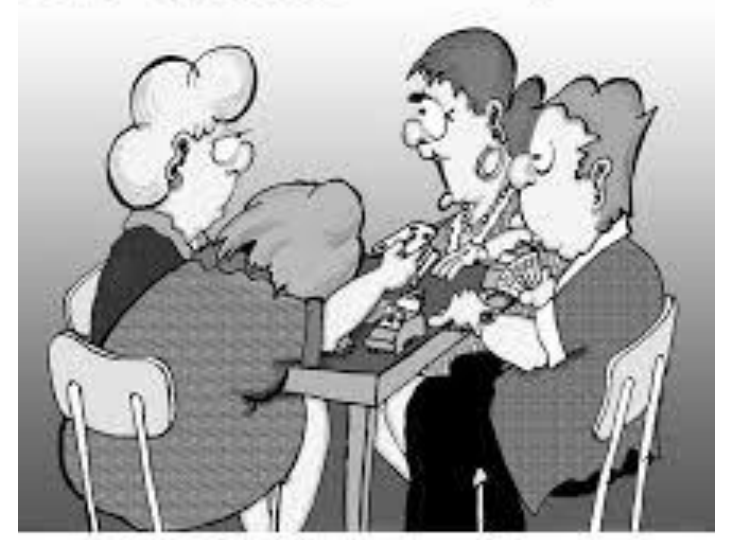
Our bridge teacher says you're to make the opening lead face down! "