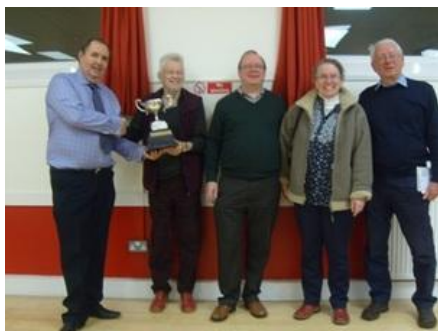
December 8th Ladies' Pairs