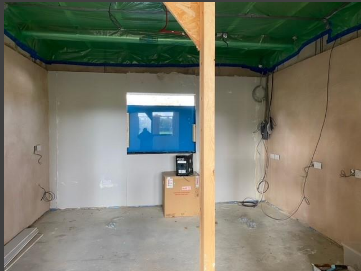
One of the team rooms (left) and the office (right)