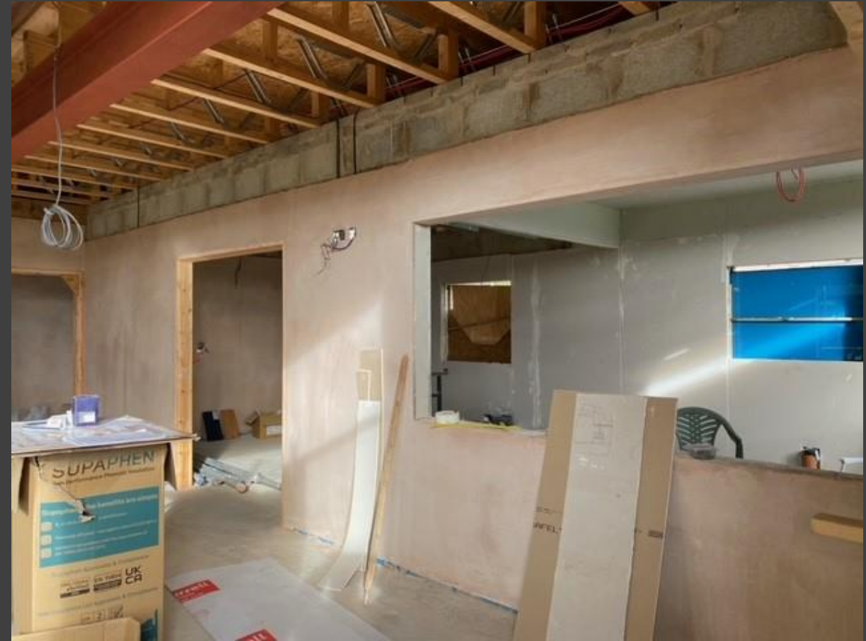
Kitchen & Seating area. From main entrance (L) and showing serving hatch and doorway from playing room (R)