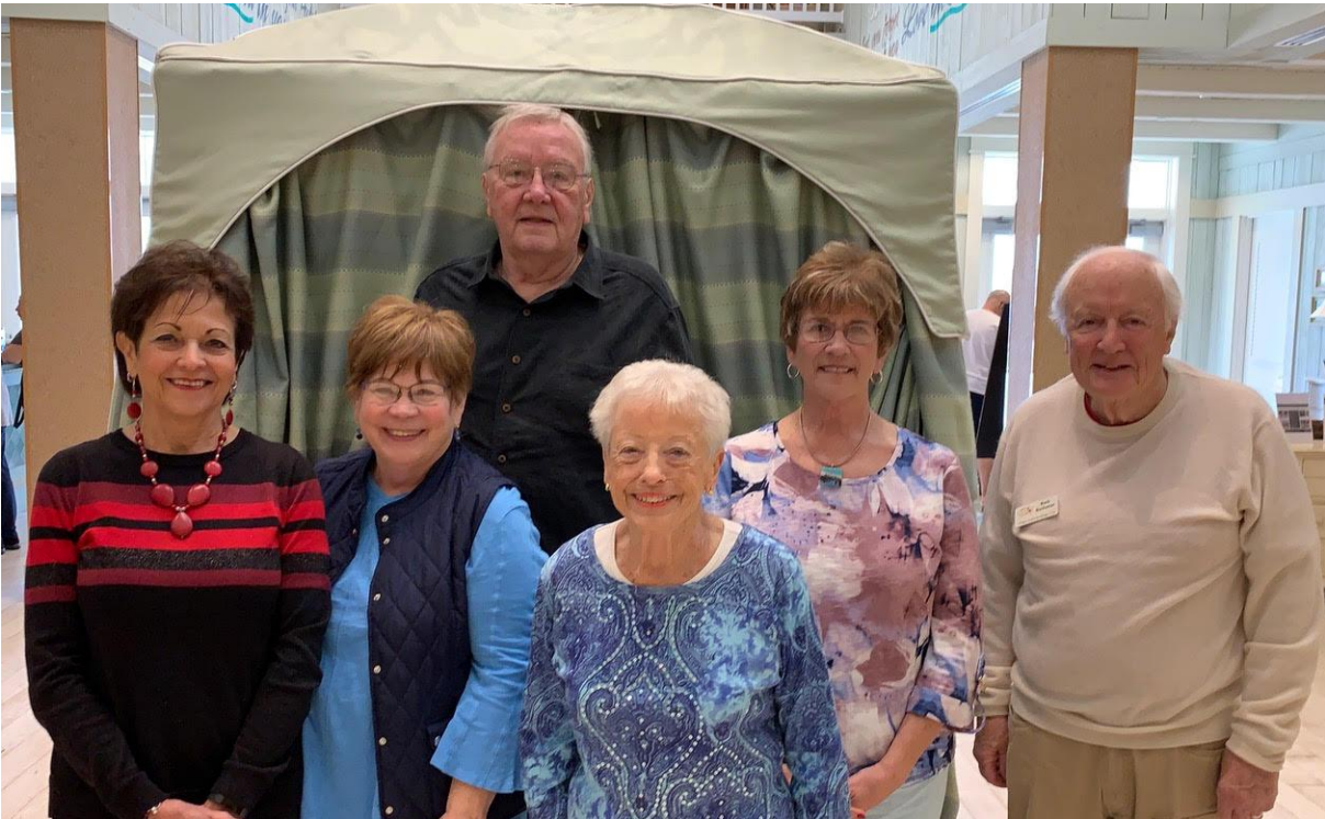
This is the newest picture of our Club News staff!