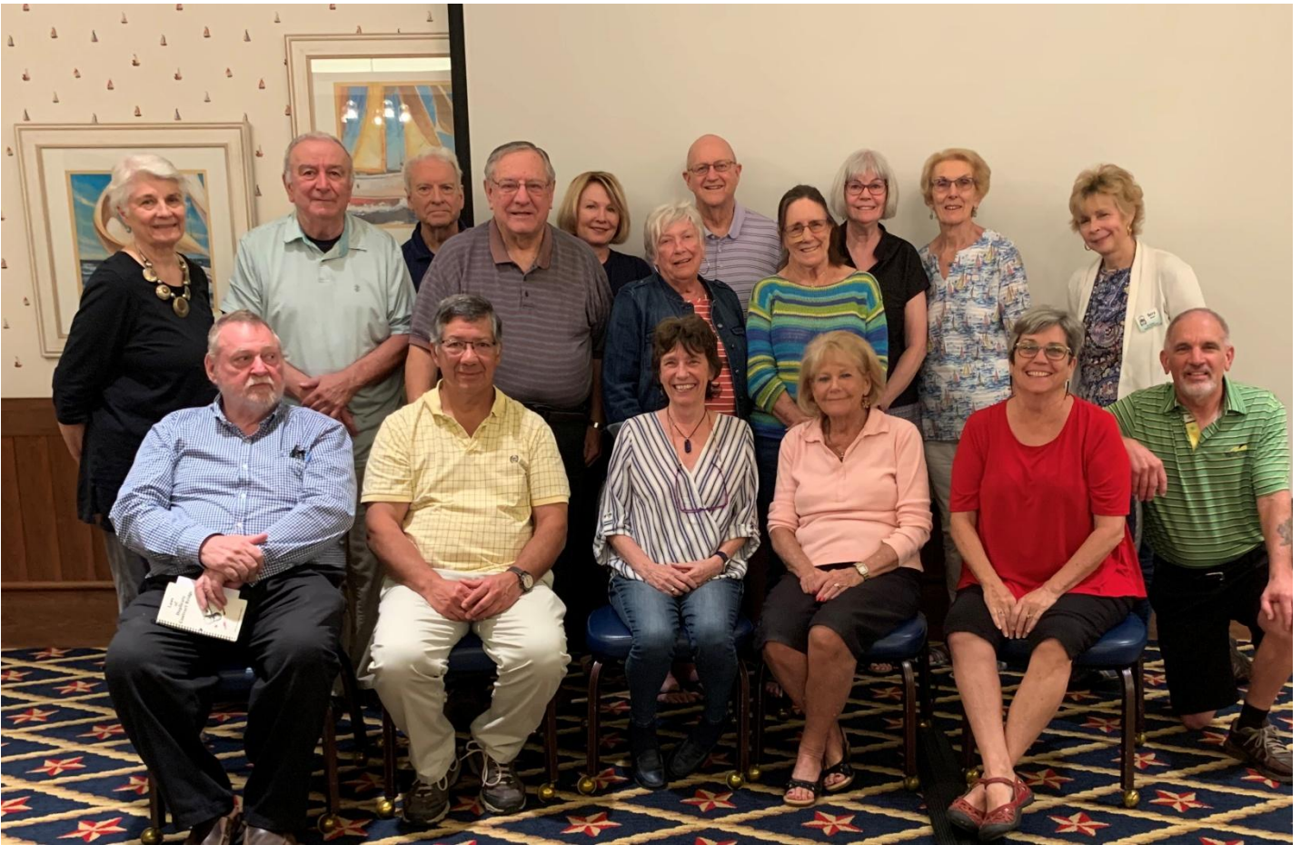
This is the newest picture of our Directors!