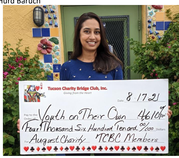
8/21 – Youth on Their Own nominated by Hurd Baruch