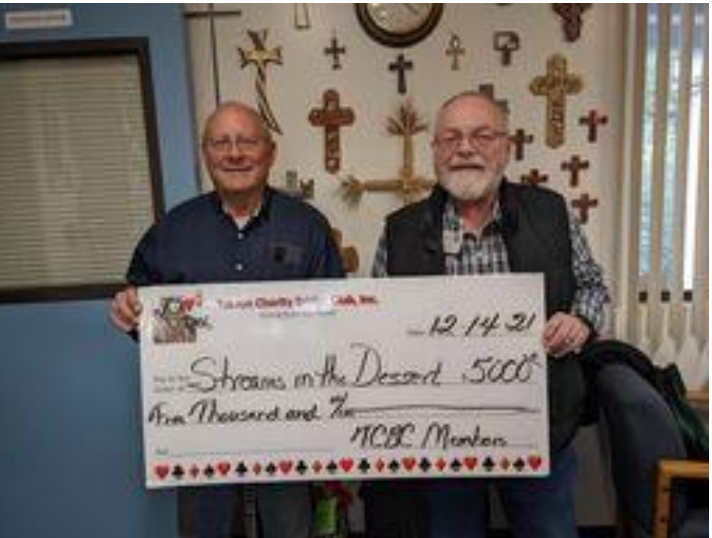
12/21 – Streams in the Desert Lutheran Church nominated by TCBC Board

2021 was a year when we took in less in table fees as we did in previous years but our donations to charity have been greater than ever before. Our Board is very committed to fulfilling our mission to play bridge and benefit our community.