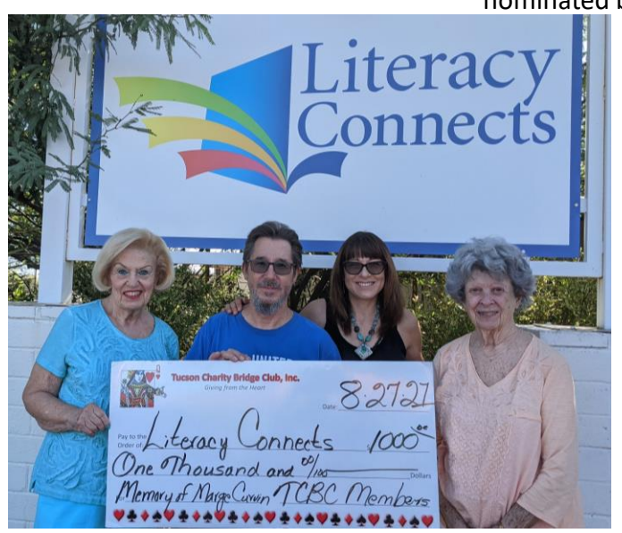
8/21 – Literacy Connects in memory of Marge Curvin