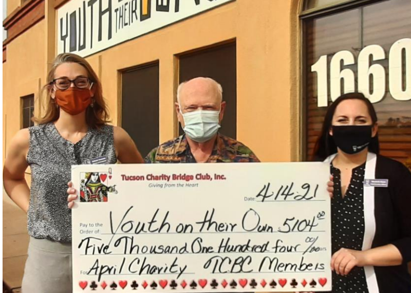
4/21 – Youth on Their Own nominated by Hurd Baruch