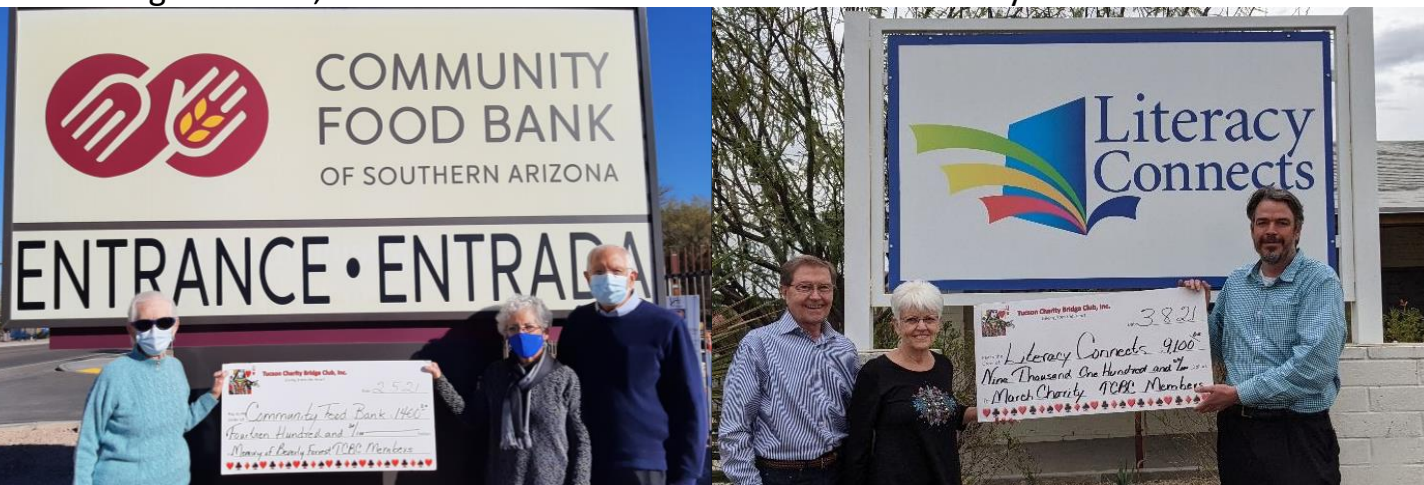
2/21 – Community Food Bank in Memory of Beverly Forrest