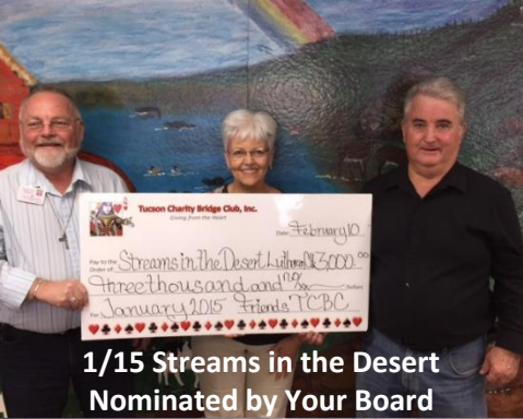
1/15 Streams in the Desert Nominated by Your Board