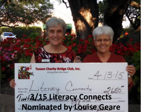
3/15 Literacy Connects Nominated by Louise Geare