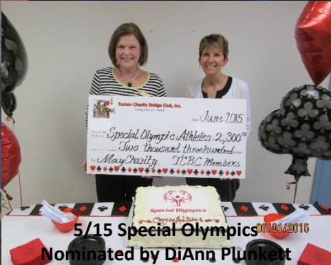
5/15 Special Olympics Nominated by DiAnn Plunkett