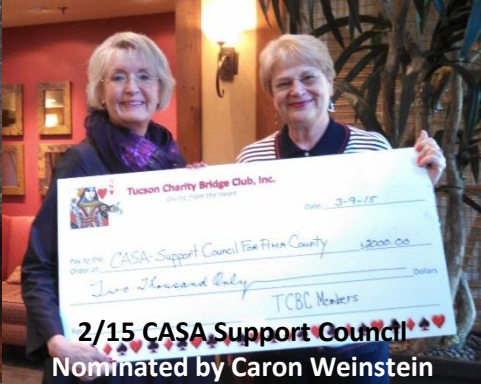
2/15 CASA Support Council Nominated by Caron Weinstein