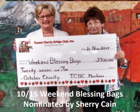
10/15 Weekend Blessing Bags Nominated by Sherry Cain