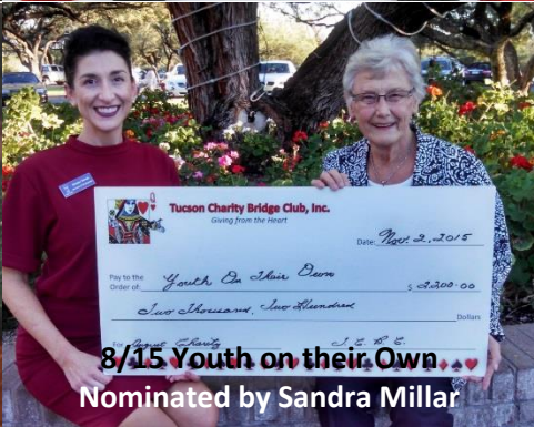
8/15 Youth on their Own Nominated by Sandra Millar