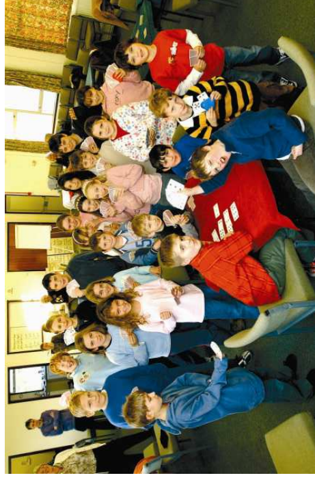
Photo of our future bridge club members

The format of the afternoon was to give a lesson for 45 minutes or so followed by a break where the kids could kick a ball around or throw a Frisbee ~ as well as have a drink and a biscuit. All lessons were free. A condition was that each youngster should be accompanied by a (grand)parent and the hope was that they would be clamouring to play MiniBridge (to the standard they had then reached) with their (grand)parents at home.