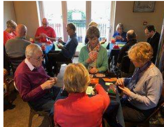
Bridge in full flow