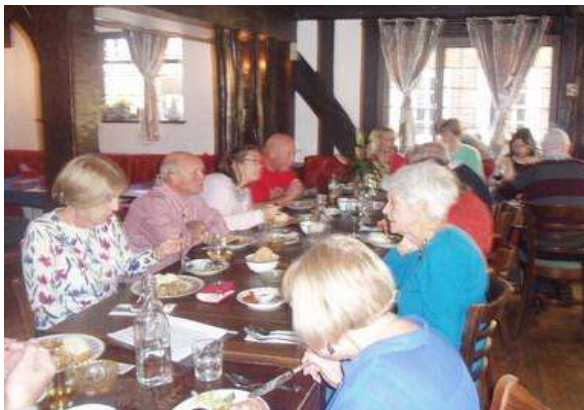
Time for Lunch