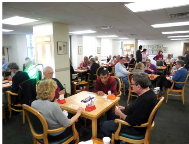
Honors Bridge Club playing area

I now must tell readers what this little venture cost: Sixty-four dollars for the two of us. Yikes! The club threw in a buffet lunch which was pretty good, but...it wasn't Little Rock.