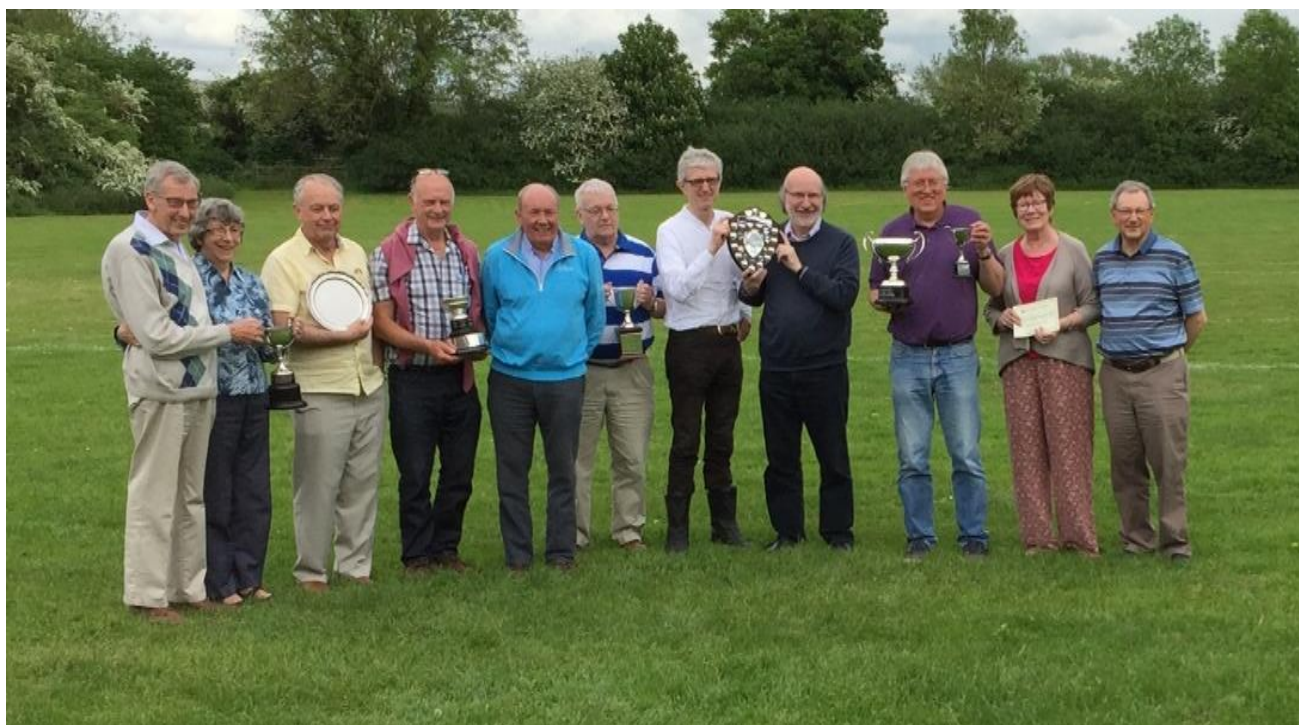
Trophy Winners at the 2016 SCBA AGM