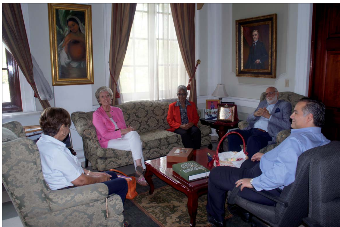
The Governor's reception