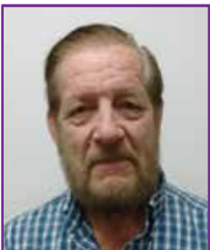
Long Beach

Our next Unit game is on March 12. Please join us.