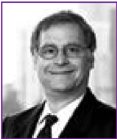
West LA