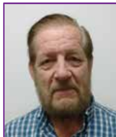
Long Beach

Unit Game, February 13, 2016 Lunch at 11:15, game at noon