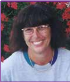
Glendale Verdugo

April Unit Game, April 9, 2016 Lunch at 11:15, game at noon