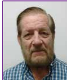
Long Beach

April Unit Game, April 9, 2016 Lunch at 11:15, game at noon