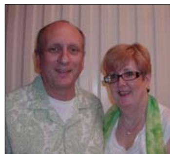
Saturday Choice Open Pairs