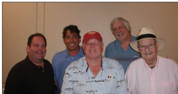
Friday Marshal Miles Swiss Teams 4 session Overall