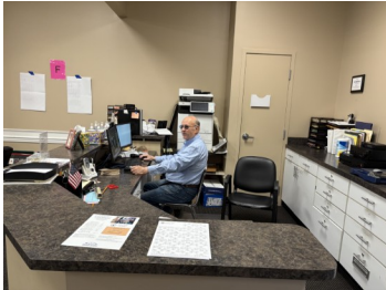
Our hard working leader